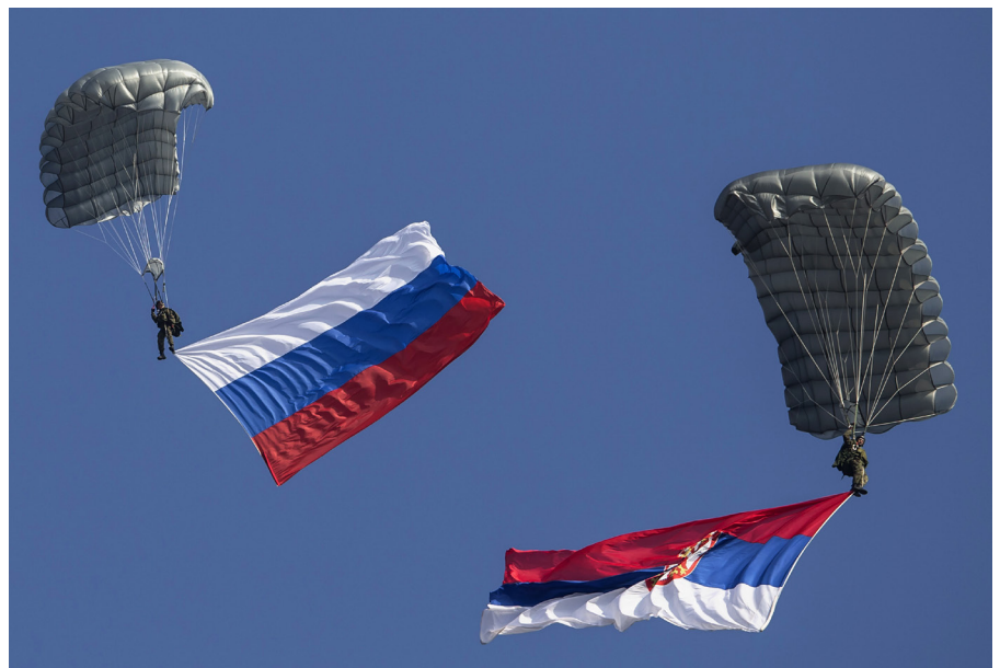
Serbian paratroopers descend to the ground holding Serbian and Russian (L) national flags during a joint exercise in the village of Nikinci, west from Belgrade, 14 November 2014.

EU Commission President Jean-Claude Juncker has responded to the current expansion fatigue in the EU countries by declaring an accession freeze for new countries until 2020. Nevertheless, the EU