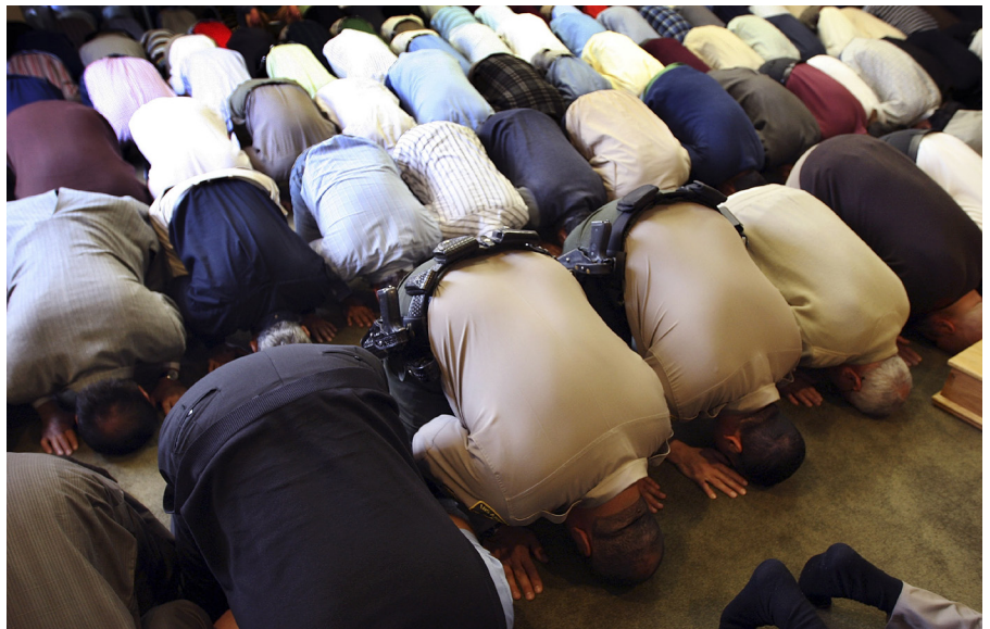
Los Angeles County sheriffs attend Friday prayers at the Islamic Center of San Gabriel Valley in Rowland Heights, California, engaging with the local Muslim community.

In 2015, the concept of CVE succeeded in establishing itself in official political jargon. In February, a three-day “CVE summit” took place in the White House, chaired by US President Barack Obama and attended by ministers from nearly 70 countries. This was followed up at the end of September by a high-level meeting on the sidelines of the UN General Assembly with the par-