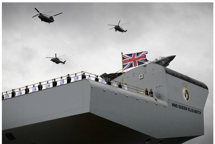
The HMS Queen Elizabeth was floated out of the docks in Rosyth (Scotland) on 17 July 2014. The first of two new aircraft carriers of the Royal Navy will be operational from 2020. Royal Navy

Following the May 2010 British general election, a coalition government was formed for the first time since World War II. Amongst many other things, the then