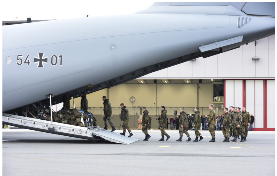
Bundeswehr personnel board an Airbus A400M at Jagel airbase in northern Germany to support the military campaign against the Islamic State from Turkey's Incirlik air base.

But would this extend as far as Germany playing a much greater military role in defending the liberal global order? The main message in the new white paper is that Germany should take on more responsibility for international security, and that Germany should therefore boost its military role on the world stage. This core message reflects an emerging trend: in recent years, Germany has become more active militarily, has promised to spend more on defense, and is cooperating more closely with allies.