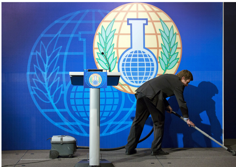
A cleaner vacuums the stage prior to an OPCW news conference at the Bel Air Hotel in The Hague October 11, 2013.

Unlike the permanent members of the UN Security Council, in the EC of the OPCW, no member state has veto power. However, decisions have to be based on a majority vote as long as Russia and other CWC members are not willing to sanction Syria. So far, CWC state parties have avoided majority voting in an effort to uphold the unity of the CWC community. Consensus voting has always been a core principle within the CWC so as to ensure that all member states are treated on an equal basis. A disregard of consensus could result in the creation of different camps constantly opposing each other regarding the implementation of the CWC, finally producing a weakening, not a strengthening, of the Convention and its organs.