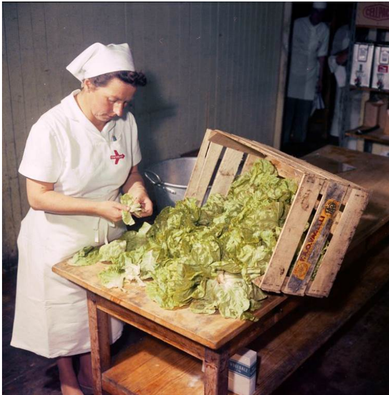
Original title: Catering, 30.9.1960

New: Swissair Catering at Zurich's Kloten Airport, 30.9.1960