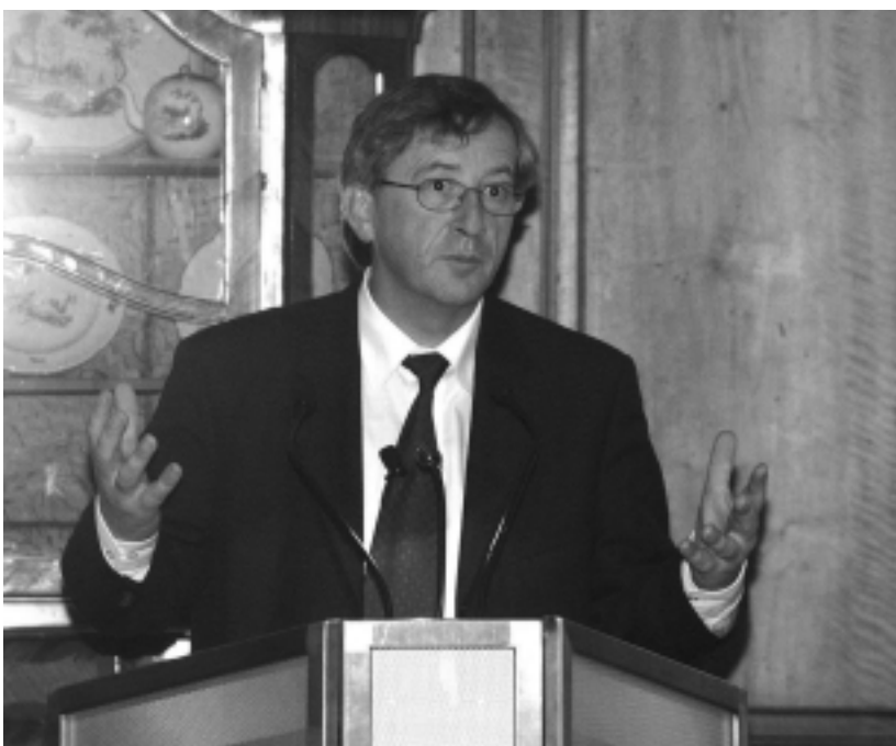
Luxembourg Prime Minister Jean-Claude Juncker stressed the important role that small European states play in the EU.

as a bureaucratic concept. The EU’s vision must encompass the entire continent, not only certain regions. And the realization of that vision must begin soon, or else other ideas, for example a misguided nationalism, might come to the fore. If Europe was not united, Djindjic warned, it would not be stable, and it would not be able to play the role in world history that it should. What was required was not only forces in the Balkan countries that promoted the European idea, but also positive energy on the part of Europe. However, the EU’s vision must not be reduced to merely material matters; it must also contain conceptual and emotional elements. Unfortunately, there was a deficit in Europe’s “European identity.” Europe itself must become clear about why the European model of solidarity, freedom, and market economy was better than all other models. A European soul was needed, if non-member states were to believe in the idea of Europe and in their own membership in the EU. ■