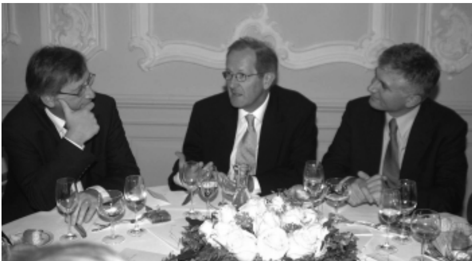
Luxembourg Prime Minister Jean-Claude Juncker, Swiss Federal Councilor Joseph Deiss, and Prime Minister of Serbia Zoran Djindjic at the 7th Zurich Churchill Symposium in October 2002.

Prime Minister of Serbia Zoran Djindjic pointed out in his speech that the idea of