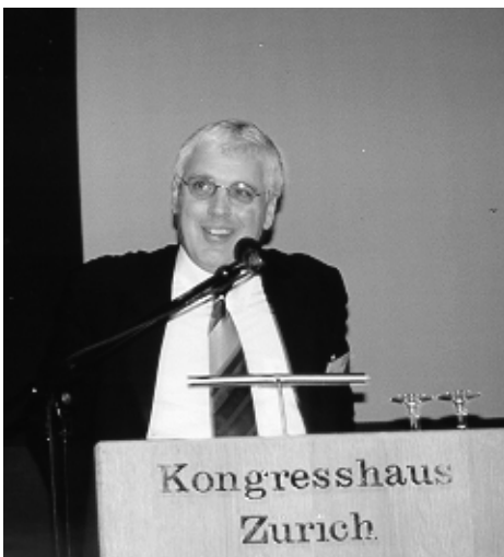
Jamie Shea talked of the lessons he had learned from his role as NATO spokesman.

each other in an armed conflict, Shea said the relationship between the two was marked by contradictions. According to the government (or NATO), the media focused too heavily on details, mistakes, and short-term costs, while forgetting the long-term objectives. NATO, in fact, had to rely on the long term, since a war could only be justified by the peace it created, and establishing peace took time. Shea also said that asymmetric warfare gave the enemy, who had direct access to the media, an advantage. For example, in NATO's Kosovo air campaign, Slobodan Milosevic had controlled the ground, and this gave him control of the pictures that journalists took and distributed. Milosevic, unlike NATO, had free access to the media, while the media had free access to NATO but no insight into what NATO's adversary was doing. Shea then addressed the way NATO deals with the media in a crisis. The crucial factor, he said, was credibility. NATO had to tell the truth about its failures in order to have people believe in its successes. Shea concluded that the media should be subjected to a code of conduct. Journalists should not lose sight of the context but should provide more in-depth information, and they should not maintain an artificial balance when presenting the different views. The media owed it to the international community to be even handed in its reporting of crises.