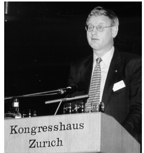
Carl Bildt delivered a keynote speech on the new security agenda.

between forces of reaction and forces of reform within a major world religion, this time within Islam and not Christianity. Again, we are likely to need military action and new political structures and frameworks of international order. Thus, we must continue to build our federation of nation states to secure peace in Europe and promote European prosperity. We must also make our contribution to the evolution of an order that is better than the old one and that can bring security, stability, and economic, social, and political development. ■