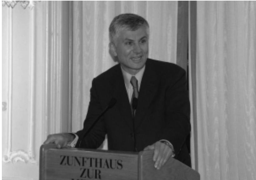
Zoran Djindjic presented his thoughts on a European vision.

“perpetual peace,” the idea of a Europe of freedom, stability, and prosperity, and a Europe without borders had long been a goal, though it had never been achieved. Today, however, this vision of a European family was close to becoming reality. But did that vision really encompass all of Europe? Was it possible for the European house to be stable, as long as its surroundings were not? The Balkan states today were in a situation similar to that of Europe in 1946–47. How could the idea of “perpetual peace” be realized in Southeastern Europe? Djindjic said that the EU could not proceed with the Balkan states as it did with