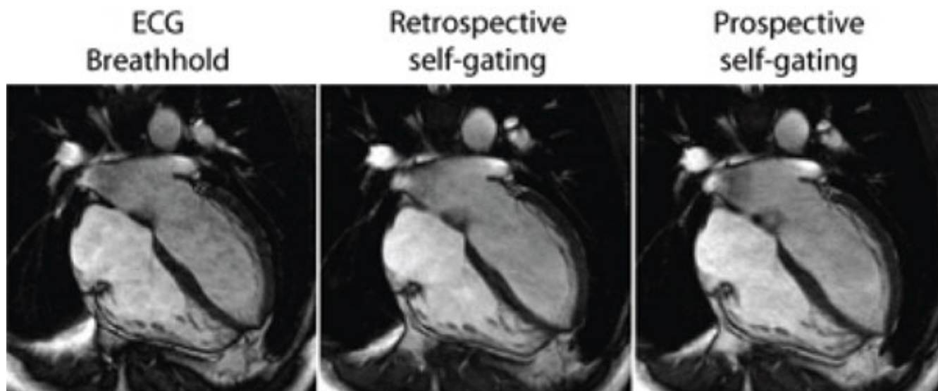
Figure 3 Images from a cardiac four chamber view. Standard ECG triggered breath-hold acquisition, retrospective self-gating acquisition and prospective real-time self-gating method. The overall image quality of the prospective method is comparable to both ECG triggered with breath-hold and retrospective acquisitions.