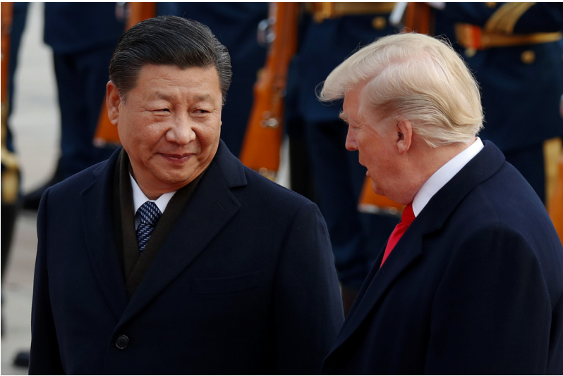
U.S. President Donald Trump takes part in a welcoming ceremony with China's President Xi Jinping at the Great Hall of the People in Beijing, China, November 9, 2017.

consistent with Xi's previously stated commitment to the "Chinese dream" of "national rejuvenation". 2