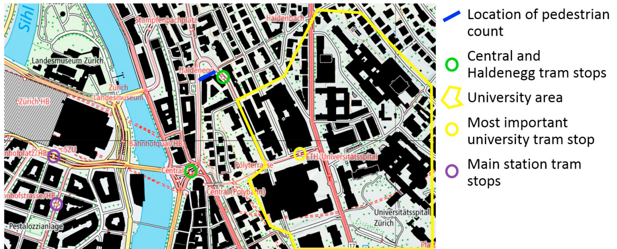
Figure 1. Map of the area, showing the locations of the pedestrian counting sensor, origin and destination areas and tram stops.

the area in question is displayed in Figure 1. As is to be expected, high traffic volumes can be observed between the station and the campus, and vice versa.