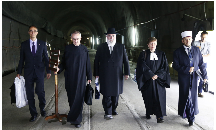
Religious coexistence in Switzerland has not always been as peaceful as it is today. Switzerland's peace policy can consequently draw on its own historical experience.

Switzerland's efforts on addressing conflicts related to the coexistence of religious communities rest on a set of values learned through often challenging historical experiences of religious and denominational conflict over centuries. Historical accommodation and a changing role of religion in society have meant that political tensions between traditional religious communities have cooled off. Nevertheless, some of Switzerland's main political cleavages were once along religious lines, and the country needed to develop operating mechanisms with