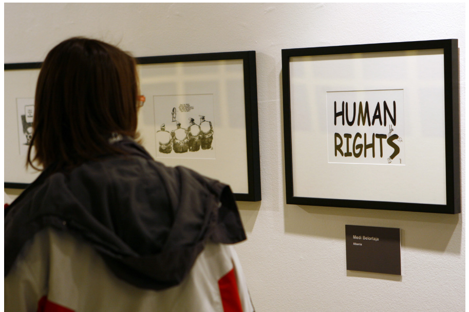
The Universal Declaration of Human Rights, here illustrated at an exhibition, is a milestone document in the history of human rights and will celebrate its 70th anniversary this year.

However, the protection of human rights around the globe remains inadequate, since those rights are often sacrificed in the interest of economic and geostrategic aims. According to Freedom House , a Washington based non-governmental organization (NGO) that measures individual rights and liberties in 195 countries alongside the UDHR's precepts, the global situation has worsened in the past ten years. The UN High Commissioner for Human Rights, addressing the UN Human Rights Council (HRC) in Geneva in March 2018, also concluded that human rights were current-