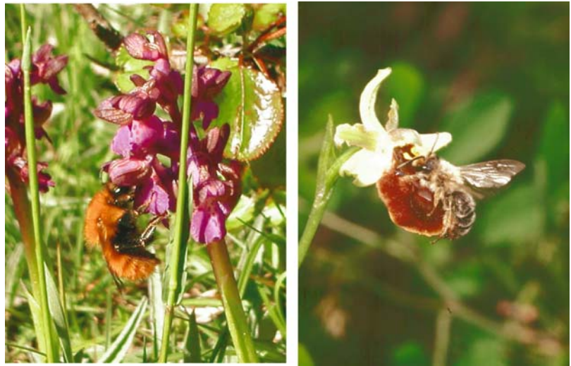
Fig. 1 Contrasting the two deceptive pollination systems food deception and sexual deception. a Anacamptis morio with one of its pollinators, Bombus pascuorum in southern Italy. b A flower of the sexually deceptive Ophrys sphegodes with its pollinator, a male of the solitary bee Andrena nigroaenea . The male carries pollinaria of this orchid on its head

imitate mating signals of certain insect species and are pollinated by sexually aroused males, that mistake the flower for a female and pollinate it during a “pseudocopulation” (Fig. 1). Like food deception, sexual deception has also evolved multiple times being represented by the European genus Ophrys , South African Disa and nine Australian genera, altogether comprising about 400 described species (Dafni and Bernhardt 1990; Steiner et al. 1994; Pridgeon et al. 1997). However, this pollination syndrome is probably more widespread as currently known, because new cases have been described recently in some genera of neotropical Maxillariinae, and Pleurothallidinae (Singer 2002; Singer et al. 2004; Blanco and Barboza 2005). Among the latter group, sexual deception may be prevalent in the large genus Lepanthes (>800 species; Blanco and Barboza 2005). Additionally, anecdotic evidence exists for other orchid genera (van der Pijl and Dodson 1966; Yadav 1995) and even one case outside the orchid family has been proposed (Rudall et al. 2002). Sexual deception differs from food deception by the exclusive attraction of male insect pollinators that have the motivation of mating rather than searching for food. Accordingly, pollination is often species-specific and floral odor, a mimicry of the pollinators sex pheromone, is crucial for pollinator attraction (Paulus and Gack 1990; Borg-Karls 1990; Bower 1996; Schiestl et al. 1999).