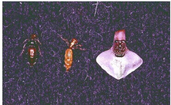
Fig. 2 Comparison of model and mimic in an Australian sexually deceptive pollination system. Two females of Neozeleboria cryptoides are shown with a labellum of a Chiloglottis trapeziformis flower. The size of the flower and its 100 times larger production of the attractive odor compound suggest that it represents a supernormal stimulus for males (Schiestl 2004)

in the pollinators (Faegri and van der Pijl 1979; Vogel 1983). Deceptive plants face the challenge of repeatedly attracting pollinators that often rapidly learn and avoid non-rewarding plants (Ackerman 1986; Ayasse et al. 2000). To do so, these plants imitate signals attractive to pollinators, a phenomenon called floral mimicry. Two types of mimicry are generally recognized among deceptive flowers. The first is Batesian mimicry in a strict sense, consisting of a “mimic” that imitates signals of a “model”, and an “operator” that responds to them (Fig. 2; Wickler 1968; Wiens 1978; Dafni and Ivri 1981; Dafni 1984; Dafni 1987). Alternatively, a model species may not exist, but plants mimic general floral signals such as bright colors and floral scent, a phenomenon termed generalized-, or non-model mimicry (Nilsson 1983; Nilsson 1992). This discrimination between two types of mimicry is important as it predicts different evolutionary outcomes (Dafni 1983; Nilsson 1992). In Batesian mimicry, the reproductive success of a mimic depends on its frequency relative to the model and the capabilities of the operator to discriminate between