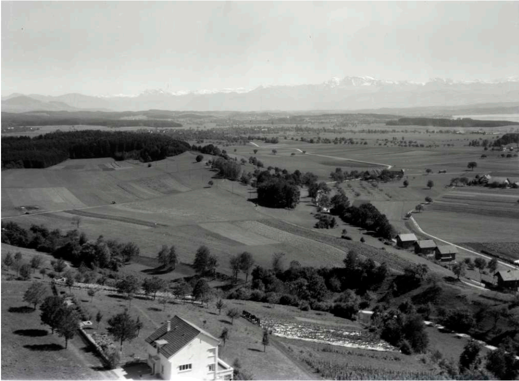
Original title: Knonauer Amt New: A Wangen (ZH), Walter Mittelholzer's house and the Upper Glatt Valley. Photo by Walter Mittelholzer