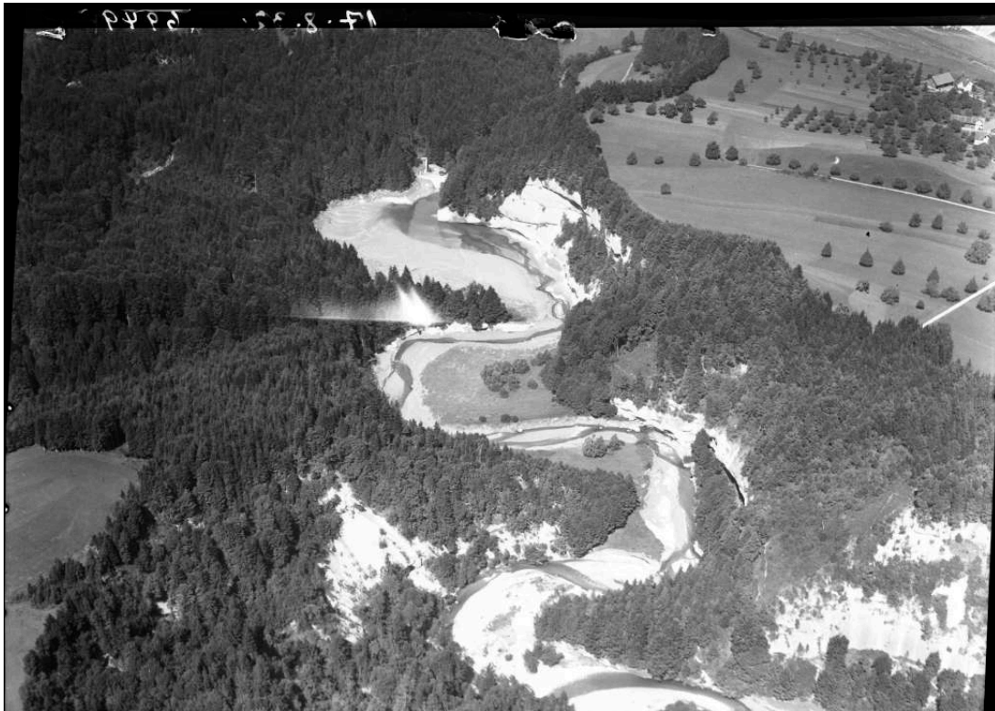
Original title: Untitled, 17.8.1932 New: Flawil-Gossau, reservoir in Glatt-Tobel near the ruins of Helfenberg Castle, 17.8.1932