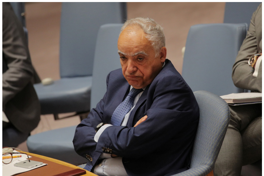
UN Libya envoy Ghassan Salamé attends a UN Security Council meeting in May 21, 2019, following weeks of intense conflict in and around Tripoli.

Should the violence escalate further and spread beyond Tripoli and its environs, the consequences would not just affect Libya but also its neighbors in Africa and Europe. An ever-growing governance gap in the country could see "Islamic State" militants, who have already begun waging an insurgency in the South-West, grow in strength. People smugglers too could step up their activities again, leading to rising numbers of migrants and refugees attempting the perilous journey across the Mediterranean.