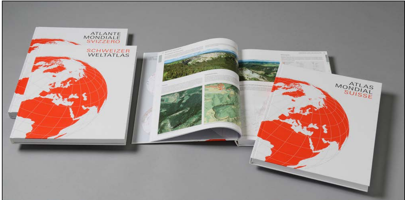
Figure 1. The Swiss World Atlas 2017 in three language versions. The open double page of the introduction chapter shows a comparison between reality and map models.

This contribution presents the concept and implementation of a new, coherent, and innovative introduction chapter for the 2017 edition of the printed Swiss World Atlas (Figure 1). A comparison to similar chapters of other widely used school atlas examples from Europe and North America serves to evaluate the didactical value of this introductory part of the Swiss World Atlas.