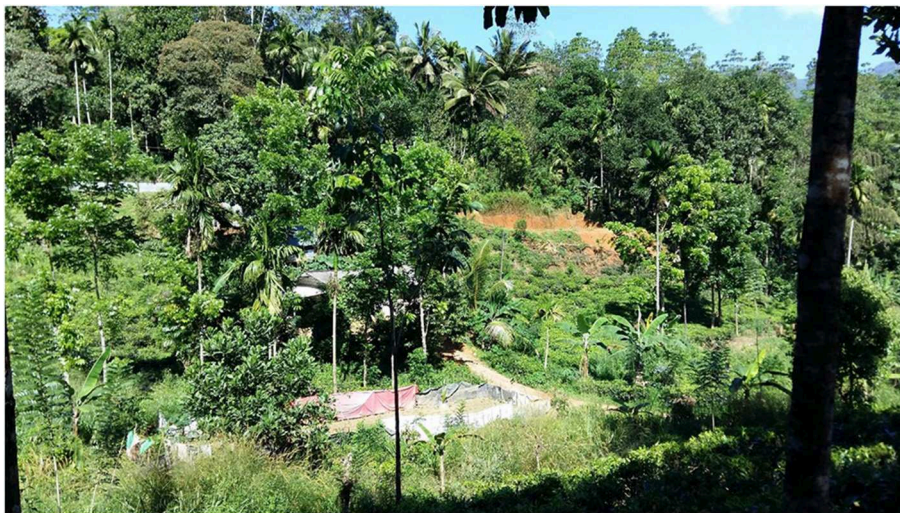
FIGURE 2 | Typical land use pattern in the study area including Kandyan Forest Garden.

is used as a shade tree, sticks used for fencing and as a support for vine crops, leaves used as a green manure). These species also occupied different layers of the canopy and therefore, represented and contributed to the diversity of homegardens in the study area.