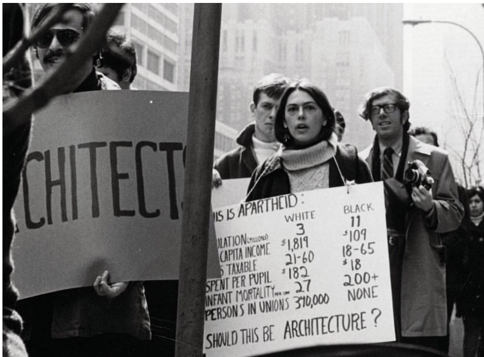
Figure 2. The 1969 "Architecture and Racism" protest organized by TAR in New York City.