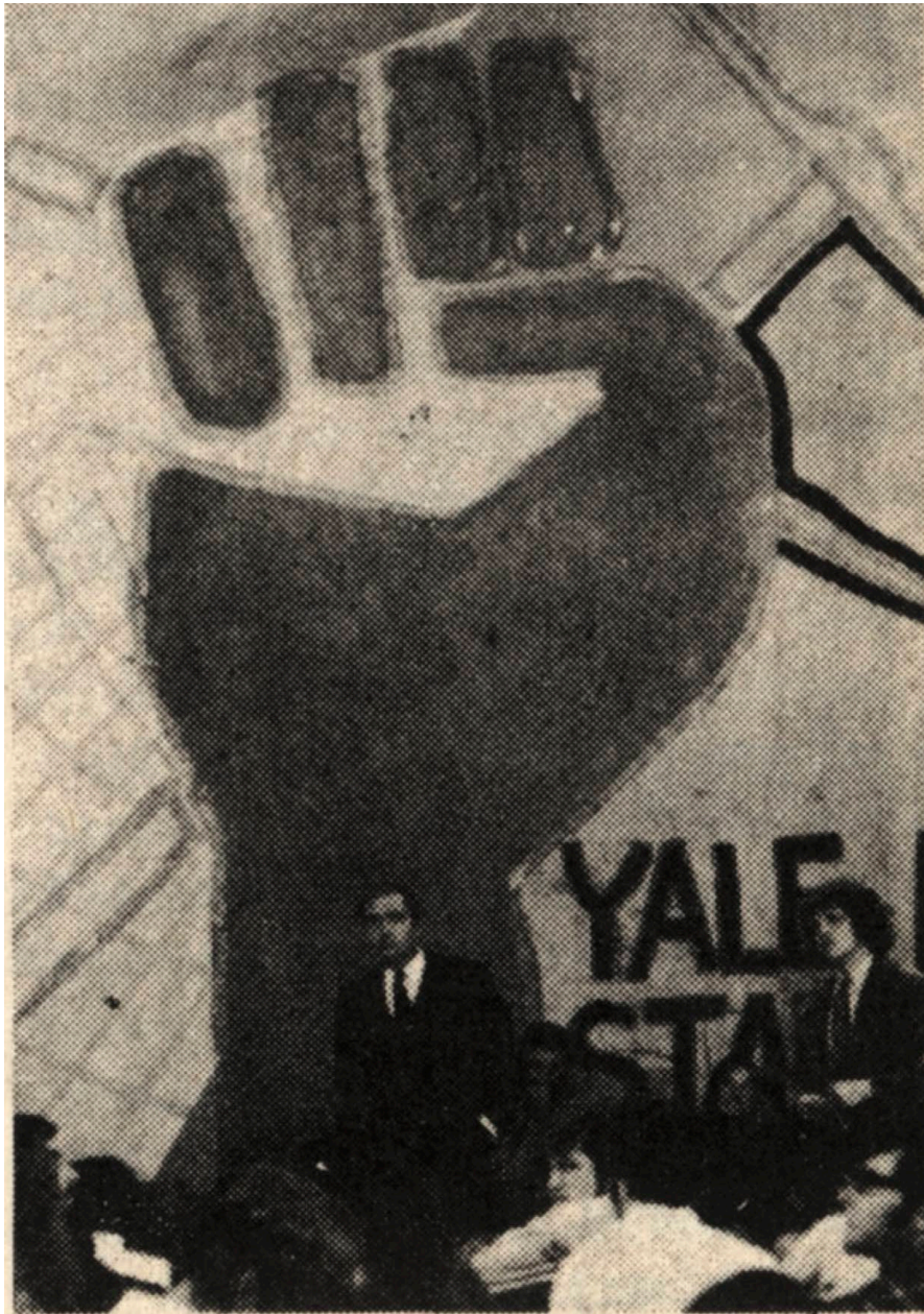
Figure 1. Yale President Kingman Brewster (centre) meeting with activist students at the School of Art and Architecture on May 12, 1969. Students adapted the familiar closed fist motif for their own radical campaigns, portraying it holding a paintbrush and a T-square.