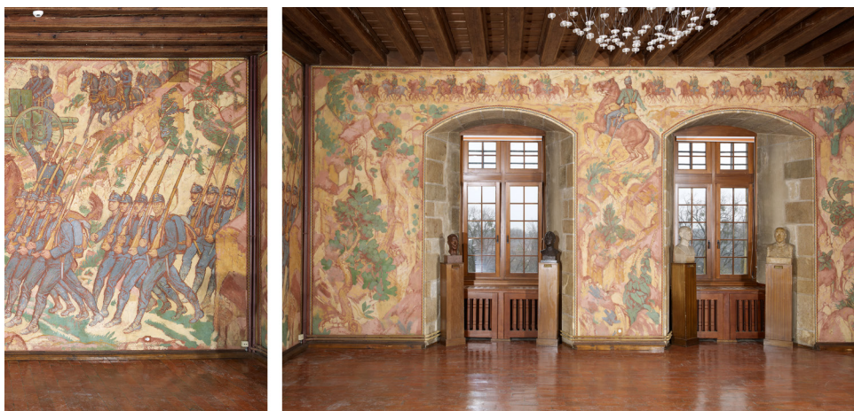
19, Colombier Castle (knights' hall), Millevigne NE.