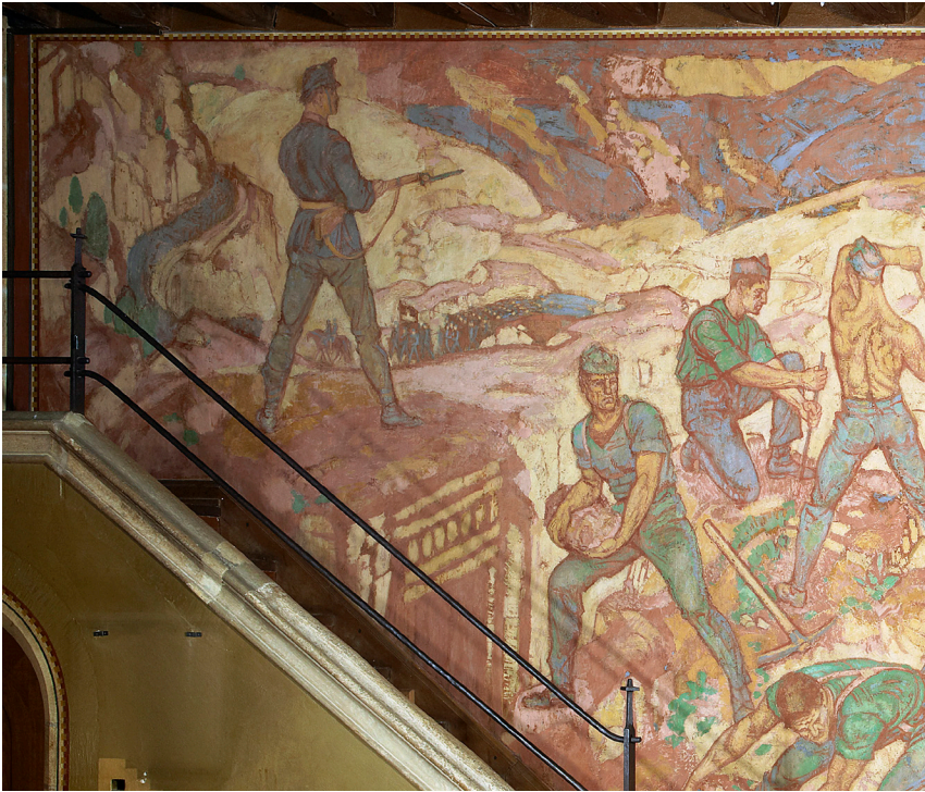
Charles L'Eplattenier, L'installation défensive (detail), 1915-19, Colombier Castle (knights' hall), Millevigne NE. Photograph by Marc Renaud, Saint-Blaise, 2012. Source: République et Canton de Neuchâtel, Office du patrimoine et de l'archéologie, Section Conservation du patrimoine.

of seamlessly inserted tapestry that dominates the hall and expands into a landscape perspective.