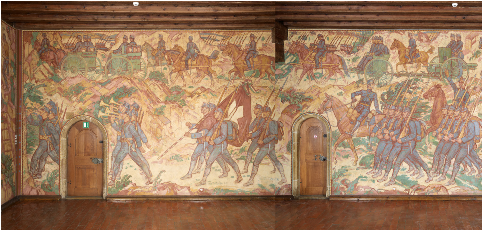
Charles L'Eplattenier, La montée à la frontière (photomontage) 1915-Saint-Blaise, 2012.

pation of the northwestern Swiss border with France near Lucelle (today belonging to the canton of Jura) by units of the Swiss army in 1914 and 1915. The portrayed soldiers seem to correspond to members of the 8 th Infantry Regiment stationed in Colombier in 1919. 7 At the time, Ferdinand-Robert-Treytorrens de Loys (1857-1917) was commander of the second division of the Swiss Army and of the caserne. De Loys had spotted L'Eplattenier drawing his comrades during the first months of the war in Saint-Maurice (Valais), where L'Eplattenier had started his service as a fortress cannoneer. The artist was therefore asked to accompany the commander and to accept a commission sponsored privately by the same.