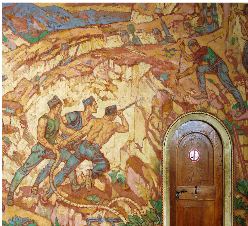
Charles L'Eplattenier, L'installation défensive (detail), 1915-19, Colombier Castle (knights' hall), Millevigne NE.

The paintings express the faith in the feasible: the militant Swiss close their ranks and prepare for the imminent danger by harnessing all their strength. The danger has not yet passed, and the men have to ward it off alone. The prerequisites for this are the tight, military order and the oath of allegiance. The paintings do not show the war activities themselves. They portray the real effort that the defense of the country implies: men are digging trenches.