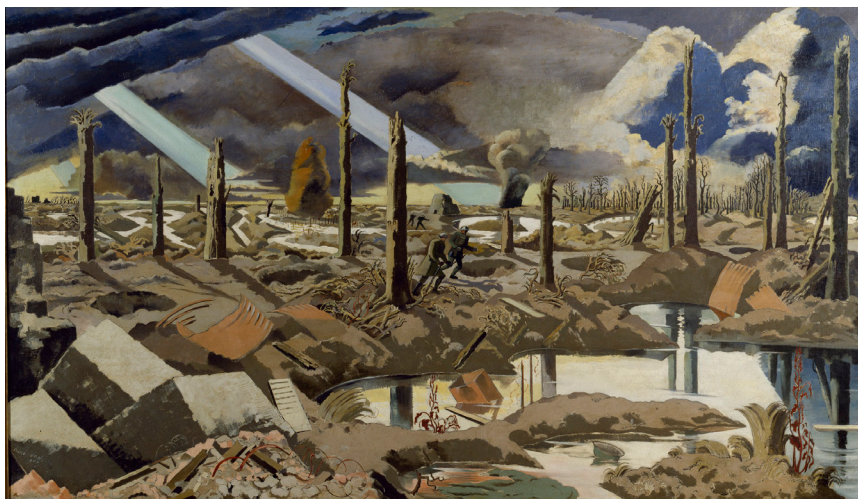
Paul Nash, The Menin Road, 1918, Imperial War Museum, London. © Imperial War Museum (Art.IWM ART 2242).

were executed and finally handed over to the Imperial War Museum. 34 The collection is exceptional in its scope, ranging from academic to avant-garde painting, and contains works that go beyond the usual stereotypes of patriotic heroism. The mood is elegiac. The scale of the British Empire's merits is measured by the magnitude of the disaster. Thus, the memory of the traumatic experiences receives the imperial 35 consecration: "these our common sacrifices."