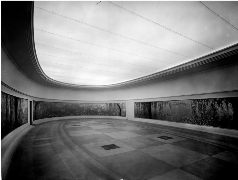
Hall of the Water Lilies (Salle des Nymphéas) with the paintings of Claude Monet, Tuileries' orangery, Paris, in 1927 (photographer unknown). Source: Ministère de la Culture—Médiathèque de l'architecture et du patrimoine, Dist. RMN Grand Palais.