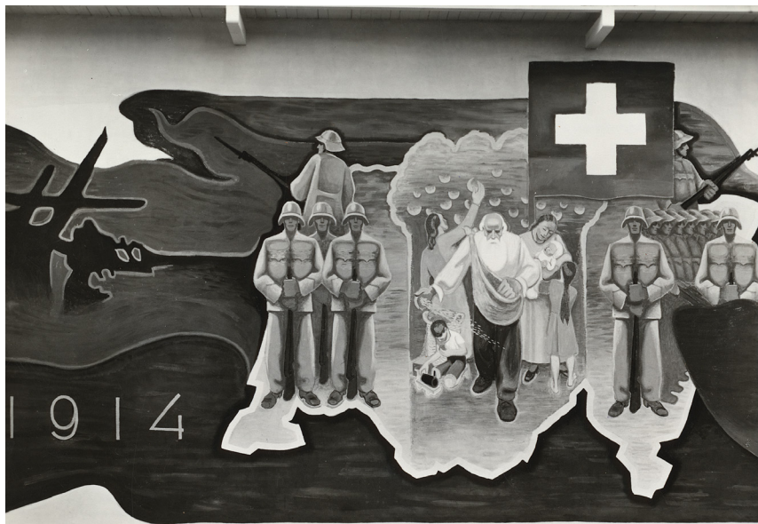
Fred Stauffer, Die starke Schweiz 1914 und die schwache Schweiz 1798 (detail), 1939, Swiss National Exposition, department Heimat und Volk (Homeland and People), Zurich (whereabouts unknown).