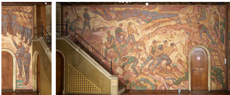
Castle (knights' hall), Millevigne NE. Photograph by Marc Renaud, Saint-Blaise, 2012. www.servation-du-patrimoine.ch