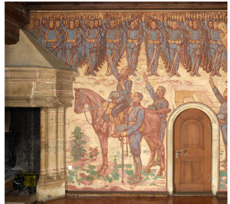
Charles L'Eplattenier, Le serment / L'installation défensive, 1915–19, Colombier