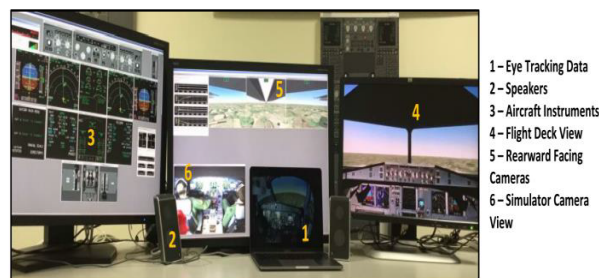
Figure 3: The layout of De-briefing Facilities in the A330-200 Voyager flight simulator.

Flight Simulator. The A330-200 Voyager flight simulator developed by Thales provides state-of-the-art military avionics, mission systems and to Air Tanker. Thales has also provided ground mission training systems, including a full-flight simulator together with other training devices and services for aircrew. The De-Briefing Facilities (DBF) are shown in Figure 3 and comprise a desktop computer and combination of monitors and speakers linked to the flight simulator. The layout of consoles on the DBF is as follows: Section-1 is the screen of eye scan patterns related to training pilots’ attention distributions, this is an additional display will be shown to instructor pilots at phase-3 of the experiment; Section-2 is a speaker; Section-3 reproduces cockpit instruments relating to all flight parameters; Section-4 is the flight deck view that can be seen by pilots; Section-5 is the view of rearward facing camera; Section-6 is the view of simulator camera.