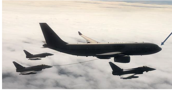
Figure 1: The air tanker A330-200 performing air-to-air refueling to the fighters.

The path of visual attention in the flight simulator can reveal pilots' cognitive processes in terms of human-computer interaction [5, 6]. Therefore, information collected through eye tracking has potential not only for pilot training but also for flight deck design evaluation [7]. To apply eye tracking technology in the context of monitoring tasks, it is necessary to understand pilot scan patterns relate to task performance, such as how pilots guide their eye movements during different operational phases and how eye scan patterns change during unexpected situations [8]. High fidelity flight simulators can record and playback almost every element of a simulation to aid instruction and improving training efficiency. However, a limitation of the current generation of flight simulators is that they cannot monitor where a pilot fixated precisely. As a trainee pilot faces forwards in a simulator, their face generally can't be seen by the instructor, who will normally be sat behind them. An instructor may therefore miss the opportunity to identify poor scan technique or a loss of SA which in turn reinforce negative learning and ultimately a normalization of deviance in terms of bad practice.