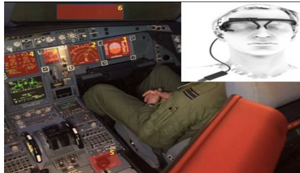
Figure 2: Instructor pilot conducting trials by wearing Pupil Lab eye tracker in the Voyager flight simulator.

Eye Tracker. A light-weight eye-tracking device “Pupil Pro” which consists of a headset including two cameras for eye movement data collection and analysis (Figure 2). The headset hosts two cameras; one facing the right eye of the participant (eye-camera) which has a resolution of 800 x 600 pixels and a frame rate of 60 Hz; the other capturing the field of vision (world-camera) and which has a resolution of 1920 x 1080 pixels and a frame rate of 60 Hz. These two cameras can be synchronized after calibration. The eye-camera is adjustable to suit different wearers’ facial layout and track their pupil parameters accordingly [9].