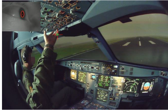
Figure 5: Eye Tracker can record a pilot's attention distributions, pupil dilation and operational behaviours in the flight deck.

performance simultaneously. According to instructors' monitoring experience, some instructors tend to form a regular scanning pattern only focusing on key operational behaviours that are most error-prone [15]. It is difficult to explain these varying attentions, however, they would suggest that the multiple sources of information that individuals have exposure to other stimulus or flight profiles, training experiences and incidents have mentally primed them differently [16]. They might have developed a pattern for processing information under normal conditions which is then repeated in time pressure situations. Hence, instructor's monitoring performance under a regular scanning pattern will remain unchanged among three stages of experiments.