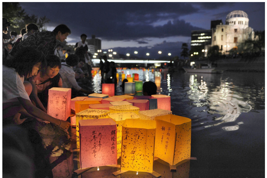
People release paper lanterns on the Motoyasu river facing the gutted Atomic Bomb Dome on the anniversary of the bombing of Hiroshima.

However, the NPT has been mired in a crisis of credibility for years. Many non-nuclear weapons states are dissatisfied with the nuclear disarmament efforts of the nuclear powers recognized by the treaty (the US, Russia, France, the UK, and China). They are also unhappy at the existence of nuclear powers outside of the NPT framework (India, Pakistan, Israel, and North Korea). Furthermore, there are complaints that jointly agreed measures to alleviate disarmament deficits are not being implemented. Against this background, certain non-nuclear weapon states in July 2017 signed a treaty that stipulates a complete ban on nuclear arms, aiming to delegitimize nuclear weapons altogether. This is evidence of polarization within the community of NPT states. Moreover, tense relations between Russia and China on the one hand and the Western nuclear weap-