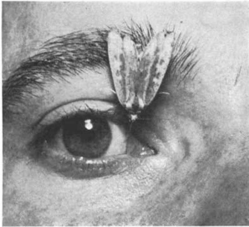
FIG. 1. Lobocraspis griseifusa Hpsn. (Noctuidae) sucking lachrymal fluid from the author's eye. Note the deep penetration of the proboscis between eye and eye lid. Chiangmai (N. Thailand), 30 May 1966.