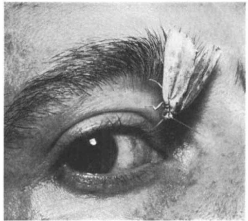
FIG. 2. Lobocraspis griseifusa Hpsn. (Noctuidae) feeding from lachrymal secretions of author's eye. Note the inflammation as a result of the moth's prolonged feeding. Chiangmai (N. Thailand), 30 May 1966.