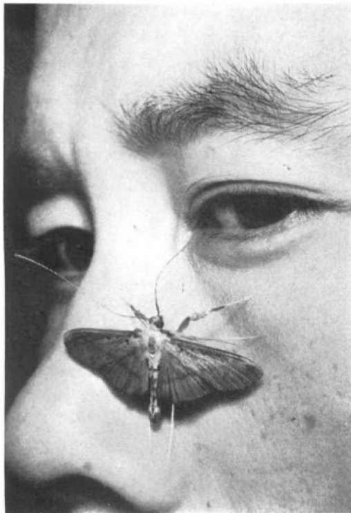
FIG. 3. Filodes fulvidorsalis Hbn. (Pyrilidae) feeding from the eye of a Thai assistant. Chiangmai (N. Thailand), September 1966.