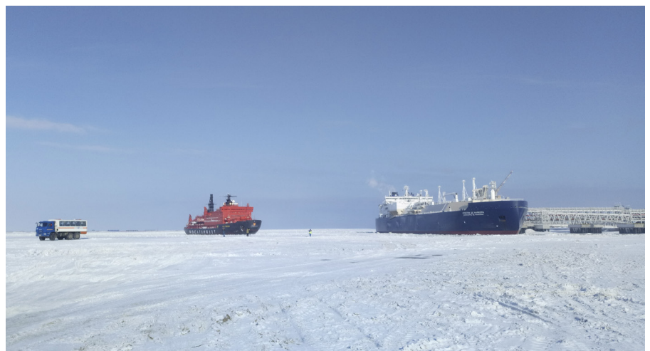
The Christophe de Margerie (R), an ice-class tanker fitted out to transport liquefied natural gas, is docked in the Arctic port of Sabetta, Yamalo-Nenets district, Russia, 30 March 2017.

These two actors are connected through a “strategic partnership” on the international