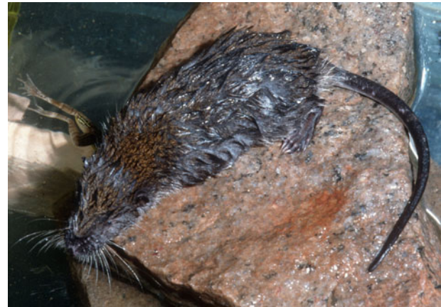
PLATE 1 The aquatic tenrec Microgale mergulus is categorized as Vulnerable because of its restricted number of known sites (10) and limited area of occupancy (< 2,000 km 2 ).

All threatened tenrec species are known from only a few individuals captured at 10 or fewer locations, making it hard to determine accurately their distribution, abundance, habitat preferences, or population trends. There have been few ecological studies and little information exists on tenrec behaviour. Few Malagasy protected areas have monitoring schemes in place. In addition, tenrec taxonomy is changing regularly as a result of ongoing genetic analyses and