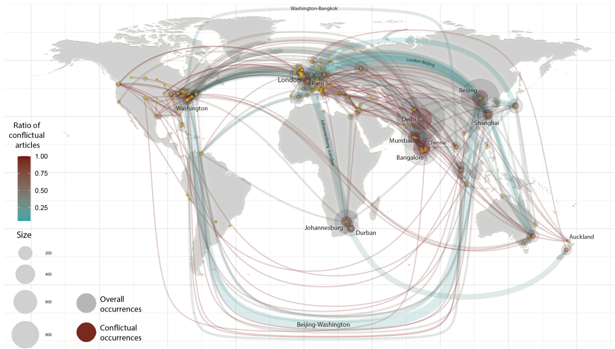
Figure 2: Undirected network of city co-mentions as introduced in Section 6.2.1; the nodes represent all cities present in the English GLOCON Gold training set. The size of the nodes corresponds to the number of occurrences that each city is mentioned. The edges are coloured according to the ratio of articles pertaining “conflict” versus “no conflict” that the cities share. The imbalanced ratio between both classes is well reflected in the map, with the light blue edges being the thickest. Edges related to conflict articles are more, but reveal lower weights.