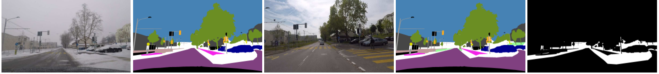
(a) Input image I (b) Stage 1 annotation (draft) (c) Corresponding image I' (d) Stage 2 annotation (GT) (e) Invalid mask J