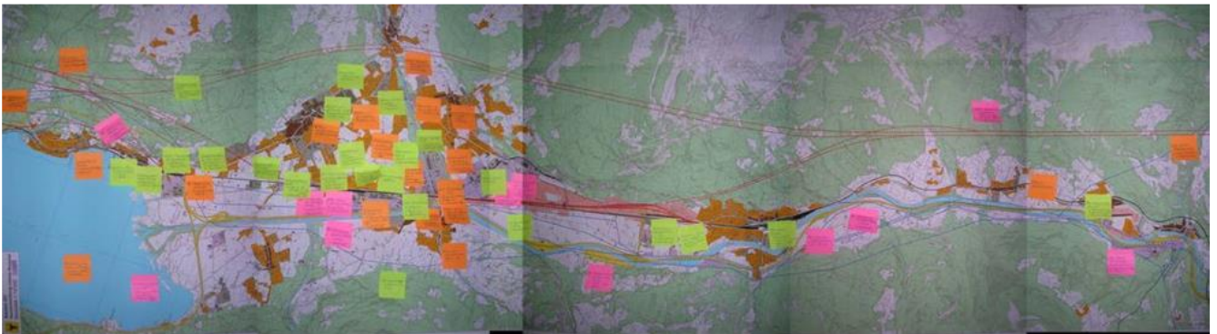
Figure 1. Unsolved conflicts and tasks as seen by the canton of Uri (Switzerland) at the beginning of the case study (‘Testplanung’) in 2006.

Traditionally, maps aspire to be as precise, clear, and unambiguous as possible. In spatial planning, however, the opposite is needed sometimes. Spatial planners increasingly have to deal with complex, multi-layered, and interdisciplinary problems. Often, there exists no ‘main problem’ to start with. Instead, planners are confronted with a heap of unsolved conflicts and tasks with unclear priority (see e.g., Figure 1). Such tasks can range from resolving the everyday traffic jam at a certain spot in the city to planning a new railway through a valley or ensuring enough affordable housing in an entire region for the next 15 years. During the creative process of finding solutions for such problems, planners create maps. The purpose thereby is manifold: To get an overview of the situation; to play with bold or seemingly impossible ideas; to gain new insights; or to test, communicate, and preserve ideas, hypotheses, and concepts.