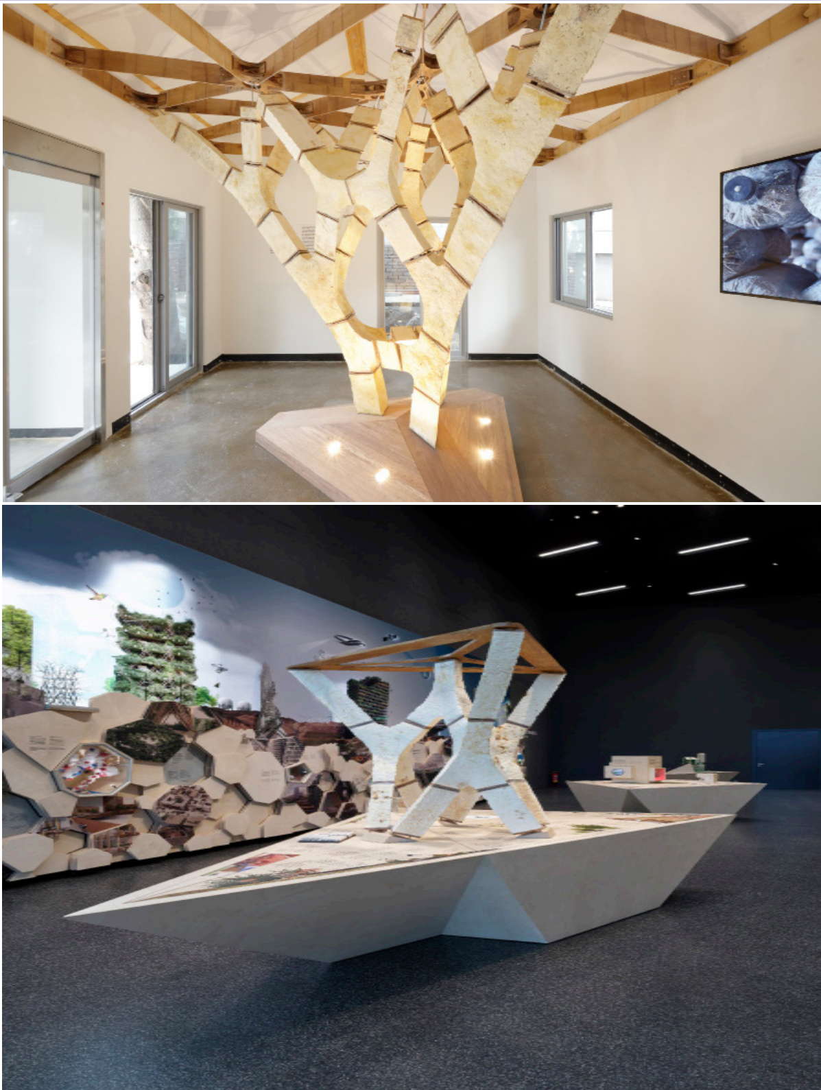
Figure 2: Mycotree structure, a) The MycoTree at the Seoul Biennale of Architecture and Urbanism, Sep 2017, b) MycoTree 2.0 at Berlin Futurium, Sep 2019