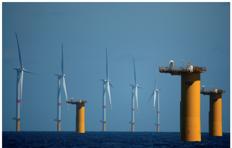
Wind turbines at the Saint-Nazaire offshore wind farm, off the coast of France, June 9, 2022.

Meanwhile, the so-called energy transition has gained new urgency, especially in Europe, partly as a result of the Russian war in Ukraine. Europe's heavy dependence on Russian gas and oil has become an element of not only climate policy, but also security policy. Specifically, the intent is to drastically reduce sources of revenue for the Russian state on the one hand and to minimize