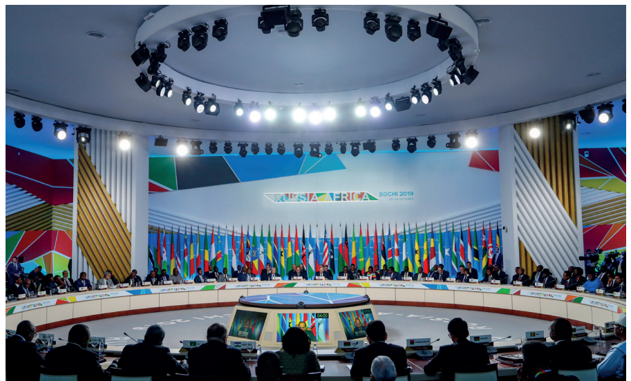
The first plenary session of the 2019 Russia-Africa Summit in Sochi, Russia, October 24, 2019.

In many ways, Africa has become another political arena in which the Russian invasion is negotiated through pressure to condemn Moscow and to join sanctions regimes. Africa serves as an indicator of how successful these efforts by the US and its allies are outside of their own constituencies. Looking at Africa is worthwhile also