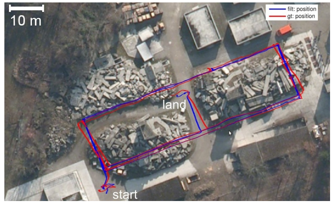
Fig. 3. Trajectory flown in a disaster area. After a short initialization phase at the start, vision-based navigation (blue) was switched on for successful completion of a more than 350 m-long trajectory, until battery limitations necessitated landing. The comparison of the estimated trajectory with the GPS ground truth (red) indicates a very low position and yaw drift of our real-time and onboard visual SLAM framework.