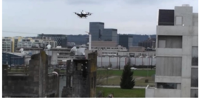
Fig. 1. The MAV operating in a disaster area, only using measurements from a monocular camera and IMU for localization

We choose a minimal sensor suite onboard our MAV, consisting of a monocular camera for sensing the scene and an Inertial Measurement Unit (IMU) providing estimates of the MAV acceleration and angular velocity. While this choice implies low power consumption and wide applicability of algorithms (e.g. same sensor suite exists in smart phones),