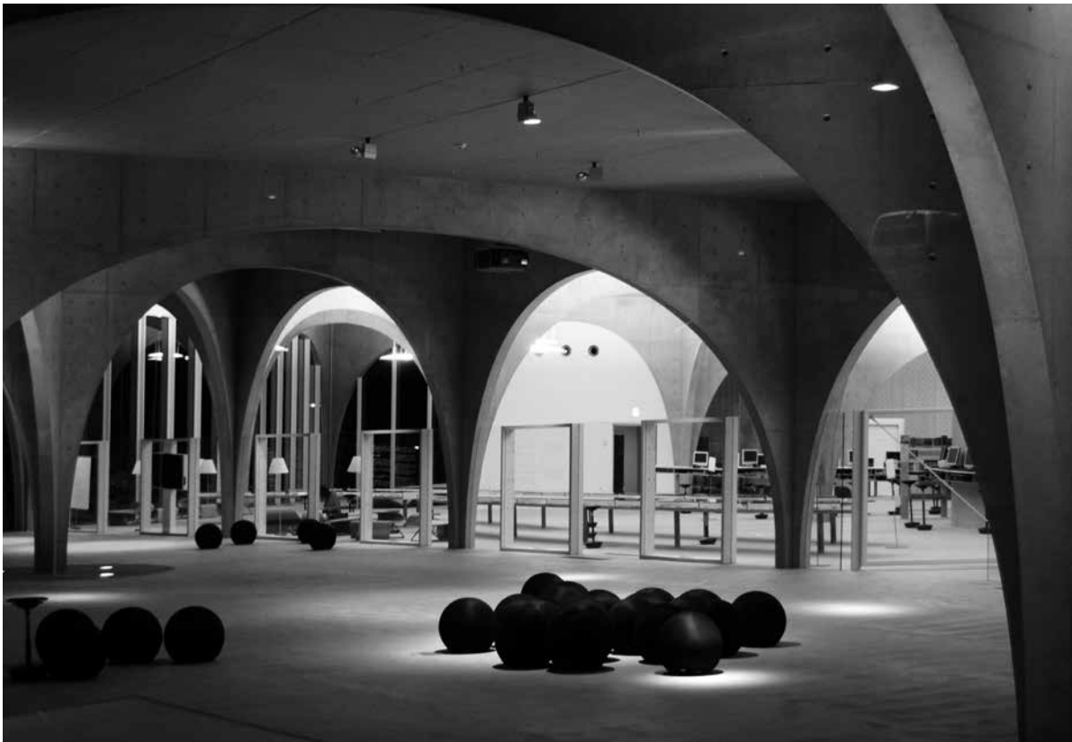
1 Tama Art University Library, Toyo Ito, Tokyo, 2007.

In his An Analogical Architecture , Aldo Rossi also emphasises the irrational dimension of analogy. 22 He quotes Carl Gustav Jung's description of analogical thinking: 'The "analogical" or fantastic thought is sensible, figurative and mute [...] Analogical thought is archaic, unconscious and practically inexpressible in words.' 23 Rossi considers analogy as a figurative expression of ideas and ways of thinking and as a method of architectural and urban design – a rationalisation of spatial experience into the production of space. This analogical thinking and empathy theory are complementary in that they both emphasise the unconscious or irrational dimension of perception, the neglected psychological dimension resulting from the separation of mind and body, and the humanistic dimension inherent in architecture but not included in previous structural analogies.