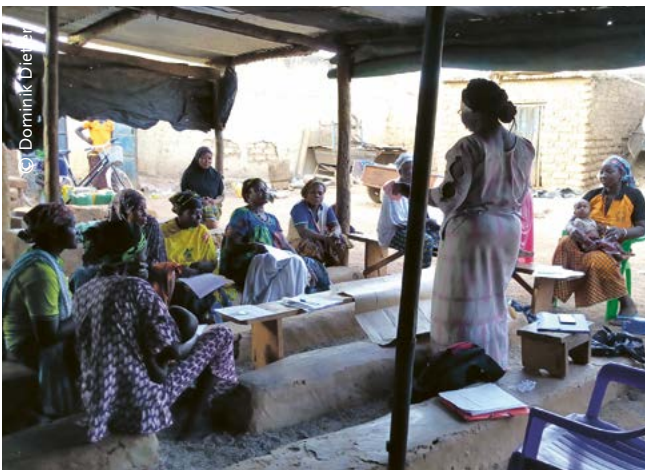
FIGURE 2: Dialogue with women in Houndé, Burkina Faso in the Health impact assessment for engaging natural resource extraction projects in sustainable development in producer regions (HIA4SD) project.

cial issue). Eschen et al. (2021) also highlight the importance of having organisations in the Global South lead R4D programmes.