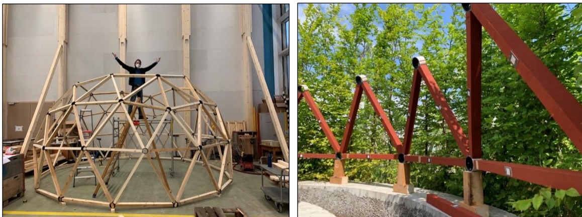
Figure 2. a) Construction of Dome1, and b) Construction of Dome2

The first-person construction experience, supplemented by additional qualitative observations from the core construction team, informed the results and discussion of this paper. The construction of Dome1 was undertaken in January 2022 with reused and recovered materials (Byers et al., 2022; Gordon et al., 2023). The deconstruction at the end of the usable life of Dome1 happened in February 2022 and the materials were transported to a new site where the same structure using the same materials was rebuilt into Dome1.2. Dome1.2 has since been deconstructed and reconstructed in a different location, but those additional life cycle(s) exceed the scope of this study. Dome2 was constructed using the same design as Dome1, but with a different set of salvaged and reused materials and a different approach to QR code engraving (i.e., using a separate tag instead of engraving directly into the material). Dome2 focuses on using different data storage and modeling from Dome1, and at the point of publication remains in the same location on its first life cycle. All domes were built with reused materials. Figure 2 below provides illustration to the construction processes of the domes.