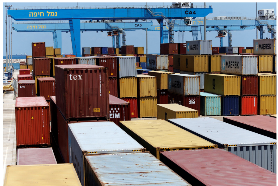
Cargo containers on the dock at Haifa Port in Israel in July 2022.

The Covid-19 pandemic and Russia’s war on Ukraine eventually laid bare a long-overlooked or deliberately ignored side effect of economic efficiency: States had become dependent on foreign supply of necessary goods or materials, including in technologies perceived as critical. Alarmed by these events, and with the prospect of further supply chain disruptions due to renewed Sino-American great power competition looming large, many states began to acknowledge