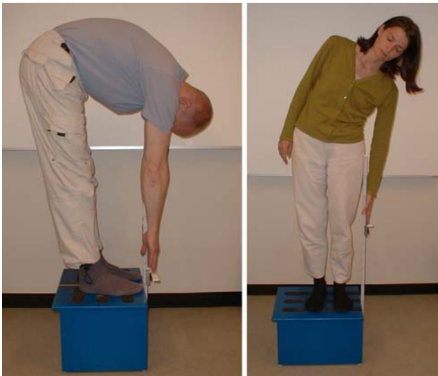
Fig. 1 Measuring the fingertip-to-floor distance in flexion and lateral bending

unit with ultrasound transmitters and receivers. The transmitters are taped to the skin and send sound pulses at 20 Hz. Three receivers, placed about 1 m behind the participant, pick up the pulses and transmit the information to a computer. There, the three-dimensional movement of each transmitter is calculated and plotted. Eight transmitters were placed on the subjects' back (see Fig. 2).