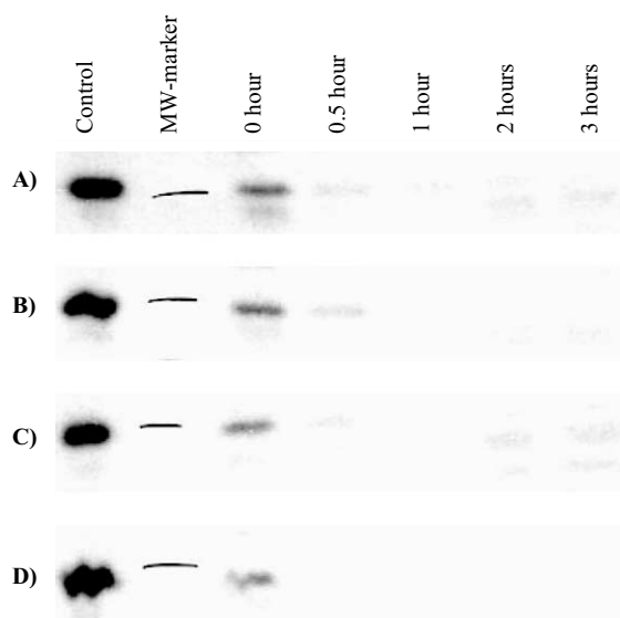
Fig. 2. Western blot analysis of MG1655:pRED2 carrying the full-length vhb gene under control of its native regulatory sequence grown in shake flasks for 3 h. The stressors were added to the following concentrations: SNP 100 \mu\text{M} (A), PQ 10 \mu\text{M} (B) and \text{H}_2\text{O}_2 10 \mu\text{M} (C). Samples for analysis were harvested after 0, 0.5, 1, 2 and 3 h. The positive control represents a VHb-containing cell extract of E. coli carrying pRED2 induced by oxygen limitation. D: Stressor-free culture. The molecular mass marker (lysozyme) has a size of 20.6 kDa.

Shake flask experiments were conducted with MG1655:pRED2 and MG1655:pOX2, carrying \Phi(vhb-cat) . Previously, we have shown that VHb protects the host cells from nitrosative stress and mediates the detoxification of NO [11]. Therefore, the use of a CAT expression strain should exclude any falsification of the expression pattern by the presence of VHb. Using this strategy, any effects on expression of a single reporter protein at the translational or posttranslational level can be circumvented. Analysis of CAT activity using an ELISA assay and determination of VHb expression by Western blotting revealed that neither of these two reporter enzymes was expressed at significant levels in E. coli under our experimental conditions (Table 2, Fig. 2). The highest expression levels of either CAT or VHb were observed at time point zero and no further induction was obtained in the presence of any of the stressors during the 3-h incubation