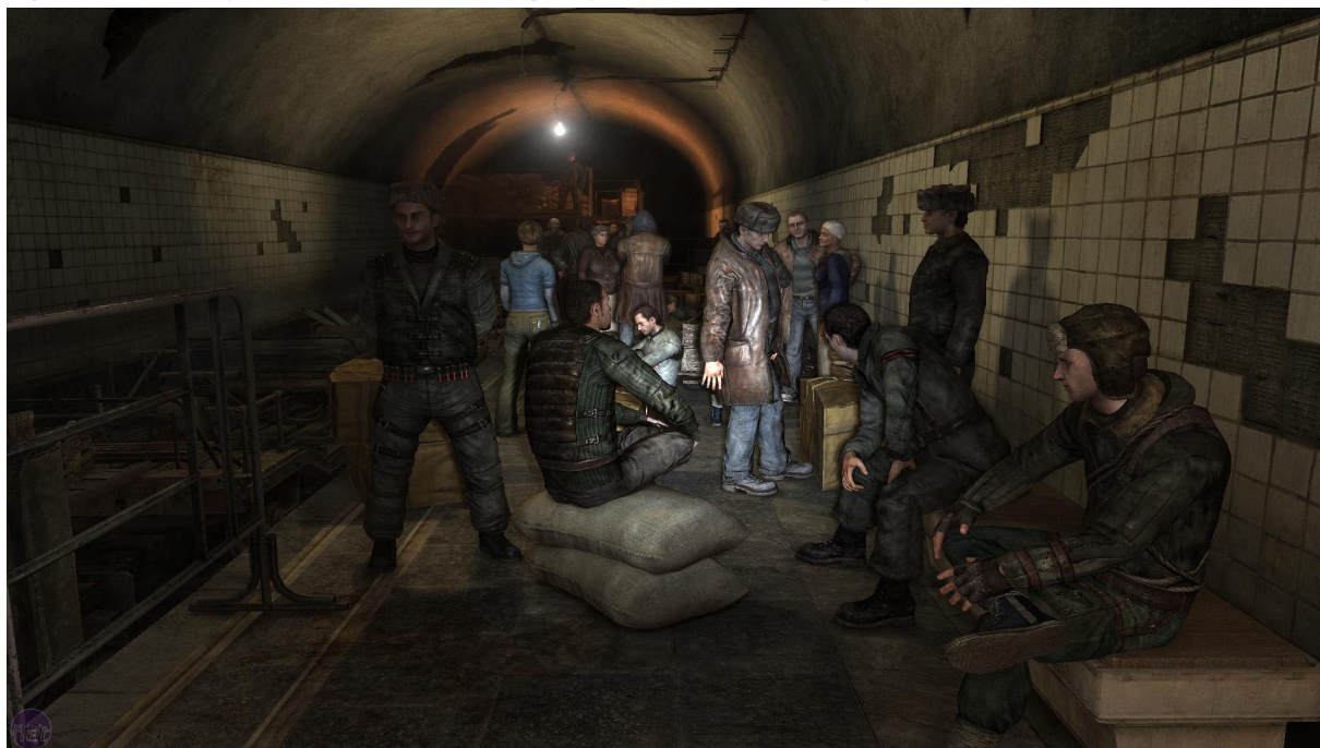
Figure 1: Screenshot from “Metro 2033”, Developed by the Ukrainian Company 4A Games ( http://enterthemetrom.com/ )