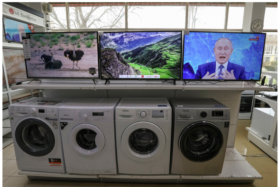
Vladimir Putin appears on a TV screen in a shop on Crimea: Russian disinformation is said to have a destabilizing role in the Ukraine conflict.

Amidst Russia’s sustained use of hybrid war instruments in Ukraine, many see it as a “testing lab” for such tools. Particularly