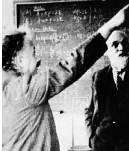
Fig. 5. Einstein and de Sitter. Photographed January 8, 1932 at Pasadena, California Institute of Technology.