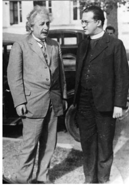
Fig. 1. Einstein and Lemaître. Photographed around 1933.

From his theoretical, dynamical model he concluded that spectra of distant, extragalactic nebulae would allow one to distinguish between static, contracting and expanding worlds. For an expanding universe redshifted spectra had to be expected with a tight relationship between nebular distances and redshifts of the form