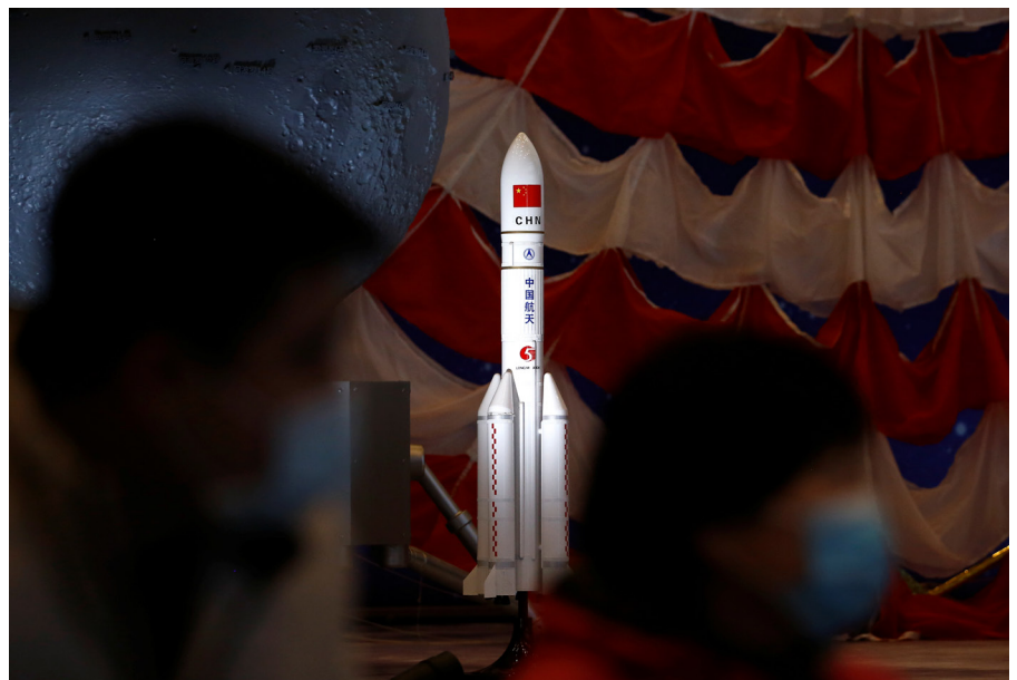
A model of the Long March 5Y rocket at an exhibition inside the National Museum in Beijing in March 2021.

Historically, a small group of powerful nations, including the United States and Russia, have dominated space. While the origins of China's space program date back to the early stages of the Cold War, it has only emerged as a major space actor in the last two decades. In recent years, China has captured global attention with achievements such as the first successful landing of its Chang'e-4 rover on the far side of the Moon in 2019, the launch of its first Mars mission, Tianwen-1, in 2021, and the completion of its own permanently crewed space station, Tiangong, in 2022.