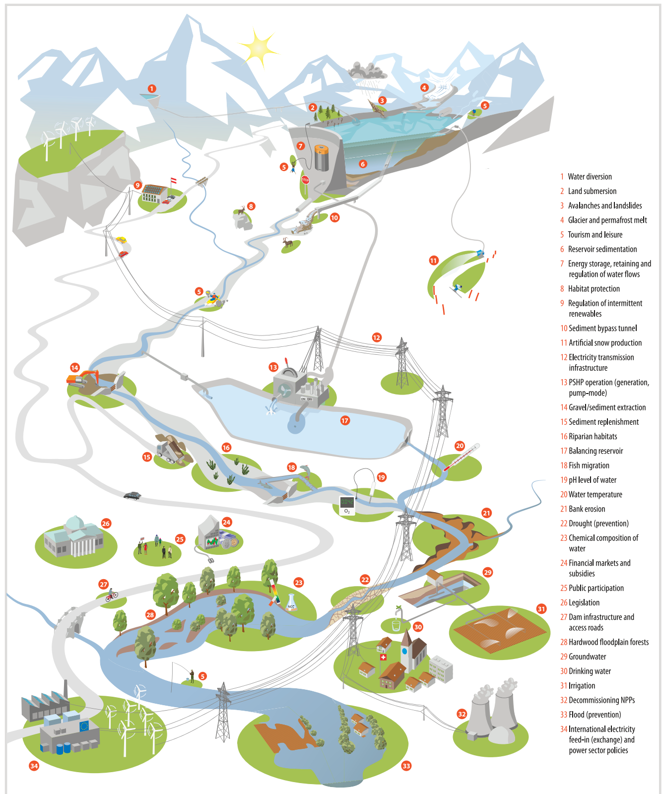
FIGURE 1. System view of PSHP operation with environmental, economic, and social relationships. (Diagram by Valentin Rüegg and Astrid Björnsen Gurung, with inputs from workshop participants)