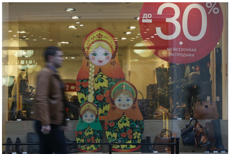
The introduction of sectoral sanctions by Western countries had a major impact on the Russian economy.

Irrespective of whether this new generation of sectoral sanctions is indeed more effective