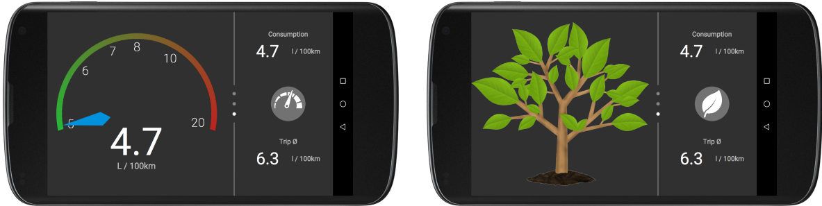
Figure 2. Non-warning feedback provided by the information system. From left to right: concrete fuel efficiency, abstract fuel efficiency.

When the smartphone is informed by the backend server that the vehicle is approaching an accident hotspot, the eco-driving feedback is replaced by warning feedback. The warning feedback displayed varies based on contextual information available about the accident hotspot. When the accident hotspot is constructed from historic data, information is displayed showing the number of accidents and the predominant type of accident. As an example, an accident hotspot is categorised as ‘rear-end collision’ when the majority of accidents making up the hotspot are of this type. When the accident hotspot is constructed from vehicle data, the number and predominant type of incident is presented to the driver.