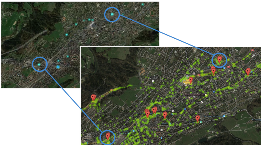
Figure 4. Preliminary results showing link between driving data and accident hotspots. Background image shows areas of heavy longitudinal deceleration in blue. Foreground image shows historic accidents in green and locations of accident hotspots with red markers.

A preliminary field test was undertaken with a small fleet of eight vehicles, for approximately two weeks, in order to collect initial data and to test the system. The vehicles did not have the warning feature enabled and the information system only provided eco-driving feedback. A preliminary exploration of the CAN data collected from the vehicles indicates promising correlations to historic accident hotspots. An example is shown in Figure 4, where heavy longitudinal deceleration could be used to identify historic accident hotspots.