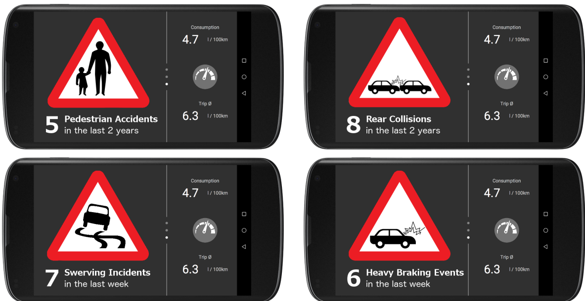
Figure 3. Examples of warning feedback provided by the information system. Top row: historic accident hotspot warnings. Bottom row: vehicle data hotspot warnings.

Klauer et al. (2006) demonstrated that, in general, brief glances away from the forward roadway, for the purpose of scanning the driving environment and the in-vehicle instrument cluster, are safe and decrease crash and near crash risk. This alertness is behaviour we aim to encourage through warning of a potentially hazardous area. The authors additionally found that a short glance from the forward roadway for a simple task only increases marginally, if at all, the risk of a crash or near crash while driving. However, the importance of non-intrusive interactions with the driver are also highlighted. The authors indicate that the risk of a crash or near crash increased twofold over normal driving behaviour when longer times of inattention were observed. In order to reduce driver inattention due to the accident hotspot warning functionality, and convey actionable information to the driver, audio and visual warnings were implemented as outlined by Cao et al. (2010). Figure 3 provide examples of both the historic accident and vehicle data hotspot information warnings.