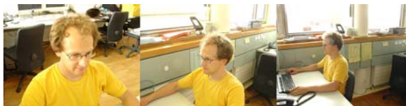
Figure 1: Different points of view of the camera

We present MatrixView (MV) – a setup to increase immersion in video conferencing systems. MV consists of a pan-tilt video camera mounted on a car which moves along a horizontal track. The car moves in such a way, that the user is kept in the center of the image (“Matrix” movie effect, see Figure 1). Using this setup in a video conference application, enables a remote user to manipulate his virtual position and orientation relatively to the acquired object or person. We use computer vision to track the remote observer’s head and adjust the camera position according to the head movements. Alternatively the camera can be remote-controlled by using a GUI. Preliminary tests have given us a positive user feedback.