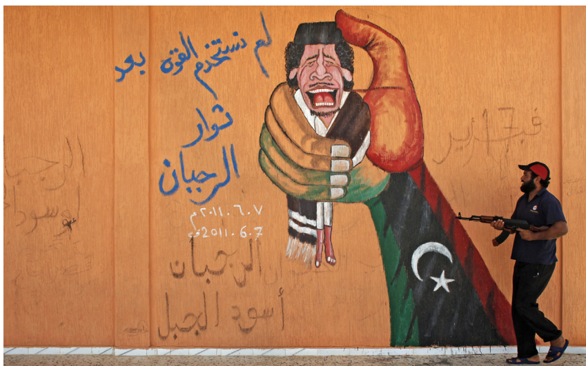
Wall with Gaddafi graffiti in Western Libya, 5 August 2011.

The dissolution of the Gaddafi regime marks zero hour for a new Libya. There is a real danger that in the absence of the former leader's authoritarian grip, the country will experience a high level of instability. However, the actions of the Transitional Council so far, as well as Libya's basic socio-economic parameters, give reason to hope for a successful transition. This would also require that the Western actors reconceptualise their role in Libya. While their intervention has been decisive in shaping the outcome of the civil war, they should limit themselves to supporting Libyan initiatives when it comes to reconstruction.