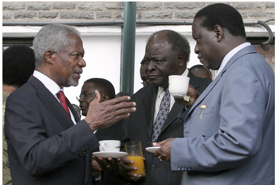
Former UN Secretary-General Kofi Annan (L) talks with Kenya's President Mwai Kibaki (C) and opposition leader Raila Odinga during mediation talks in Nairobi in January 2008.

In particular, the frequency of civil war mediation rose dramatically in the early 1990s and became the primary means through