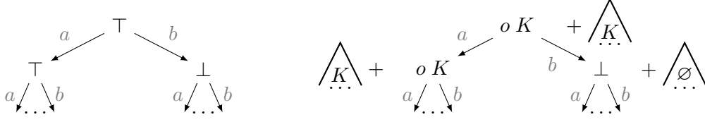
Figure 2: Tries for L (left) and the concatenation L \cdot K (right)