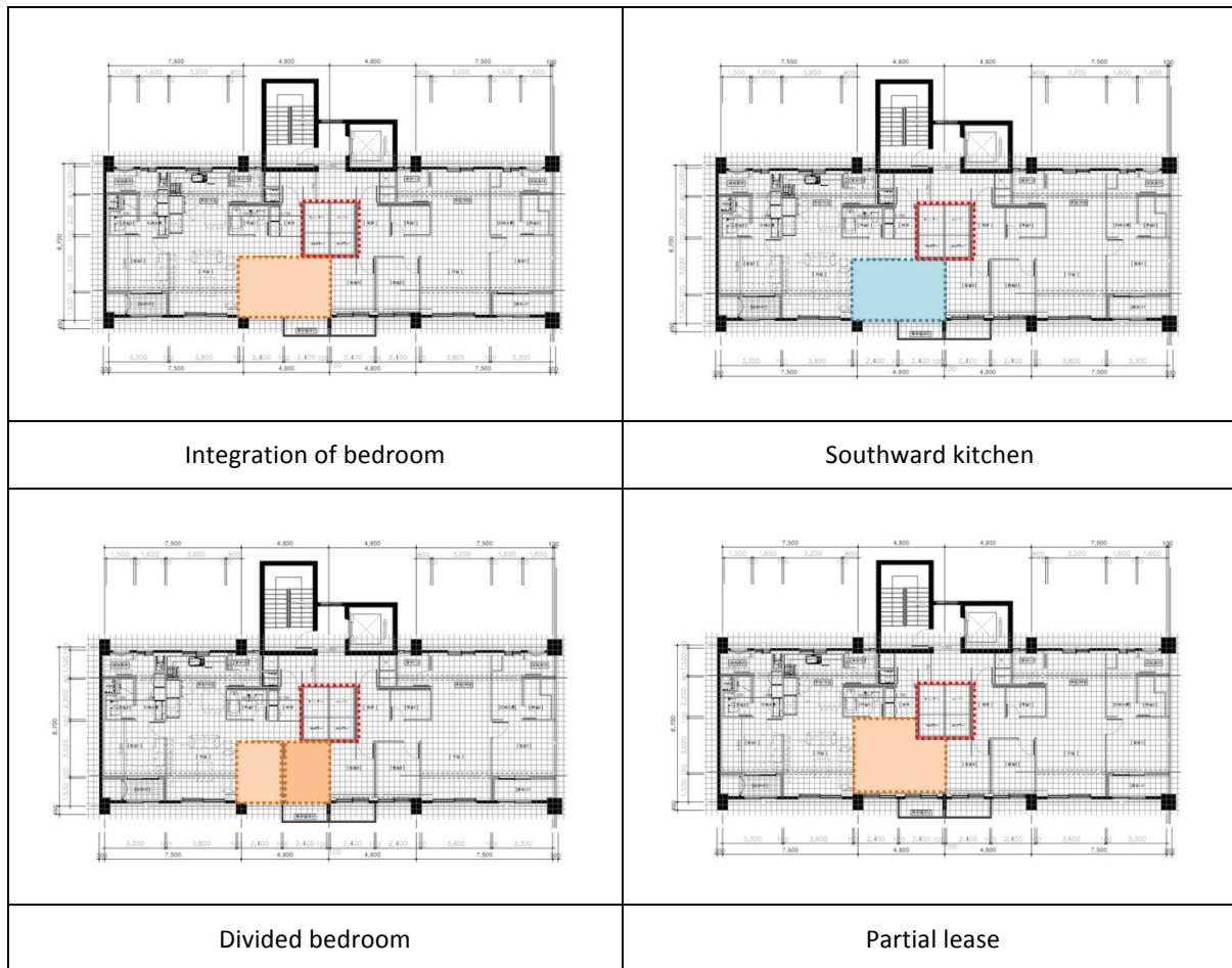
Table 1. Surface plan considering spatial change