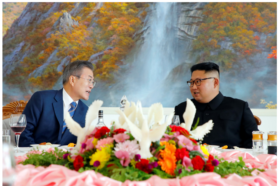
South Korean President Moon Jae-in and North Korean leader Kim Jong Un attend a luncheon in Pyongyang, North Korea, September 19, 2018.

The Korean conflict today is marked by a new set of geopolitical determinants. It is true that the security order in East Asia remains largely shaped by the bilateral agreements that the US concluded after the Second World War with its Asian allies. The latter received security guarantees and access to the US market. In return, the US secured a military presence and important alliance partnerships in Asia. Subsequently, the foreign and security policies of East Asian countries, namely South Korea, Ja-